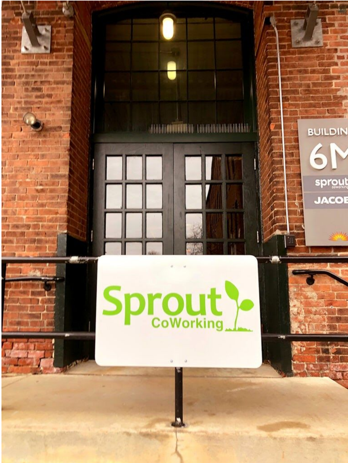
The new entrance to the Sprout CoWorking facility on Valley Street in Providence.